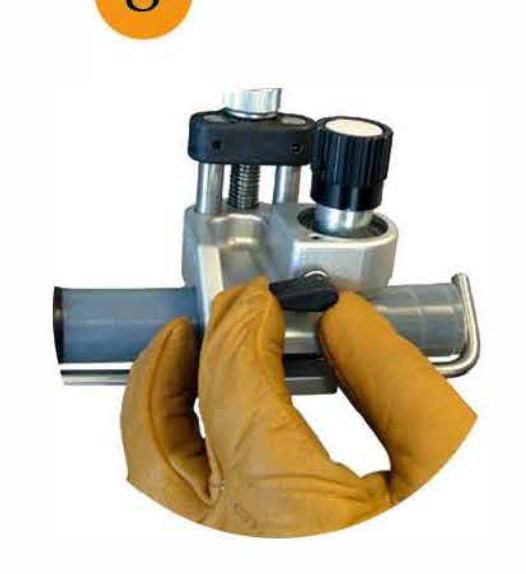
Put the blade lever in position "OFF" corresponding to the straight cutting