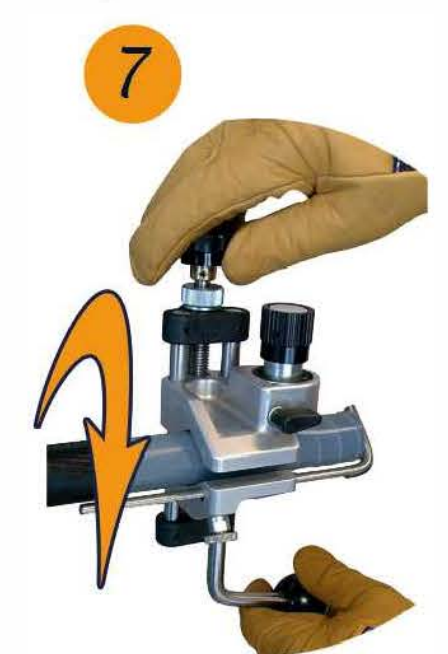
When you arrive at the stripping limit (end of the gratuated gauge in contact with the core), stop the tool Office Bitola: and+teuro backshalf a turn