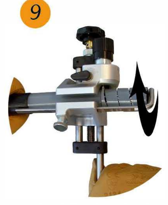
Finish with the straight cut turning 2 turns