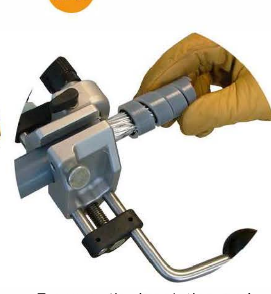
Remove the insulation and the tool

Electrolux Macedonia www.electrolux.mk electrolux@t-home.mk