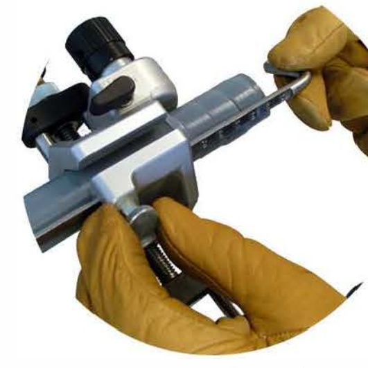
Remove the gratuated gauge